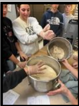
Learning the importance of weighing and measuring the ingredients.