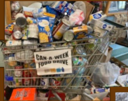
The winner of our Generosity Award with 652 was our seventh grade.