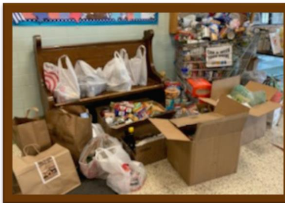
In second place with 497 was fifth grade.

St. Mary's School held a Thanksgiving Food Drive and donated $2,310.17 in dollars and food items to the Circle of Joy. This was a class competition. In third place, with 284 was our sixth grade.